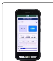
[PDA / Android OS]