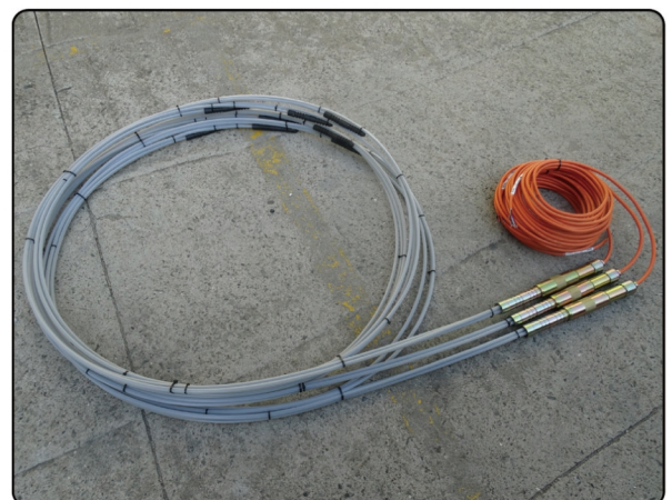
[Model 1391 ass'y]