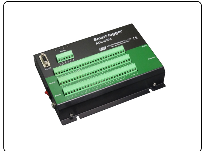
[ADL-200A Smart logger]