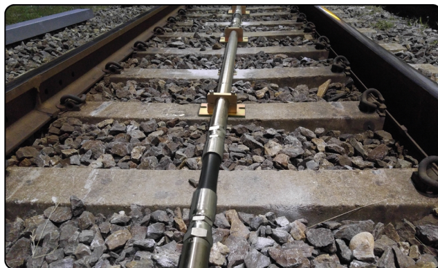
[Installation of ACE-RTM]