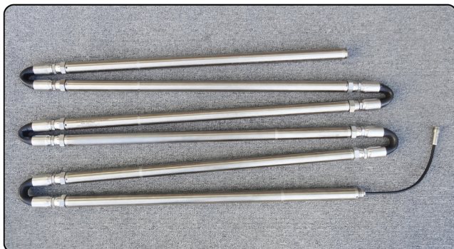
[Bundle of ACE-RTM]

The ACE-RTM connects the sensors of all points by the sequential serial communication type of one-line cable. It can be remotely measured using our ADL-200A smart logger and wireless modem.