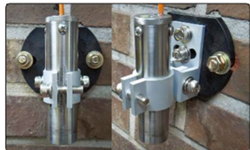
[Installation of MEMS inclinometer]